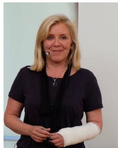
Lucy Hawking giving her talk